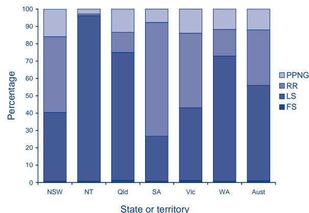
Figure 1: Penicillin resistance of gonococcal isolates, Australia, 2008, by state or territory

Infections with gonococci classified as fully sensitive (FS, MIC \leq 0.03 mg/L) or less sensitive (LS, MIC 0.06–0.5 mg/L) would be expected to respond to standard penicillin treatments, although response to treatment may vary at different anatomical sites.